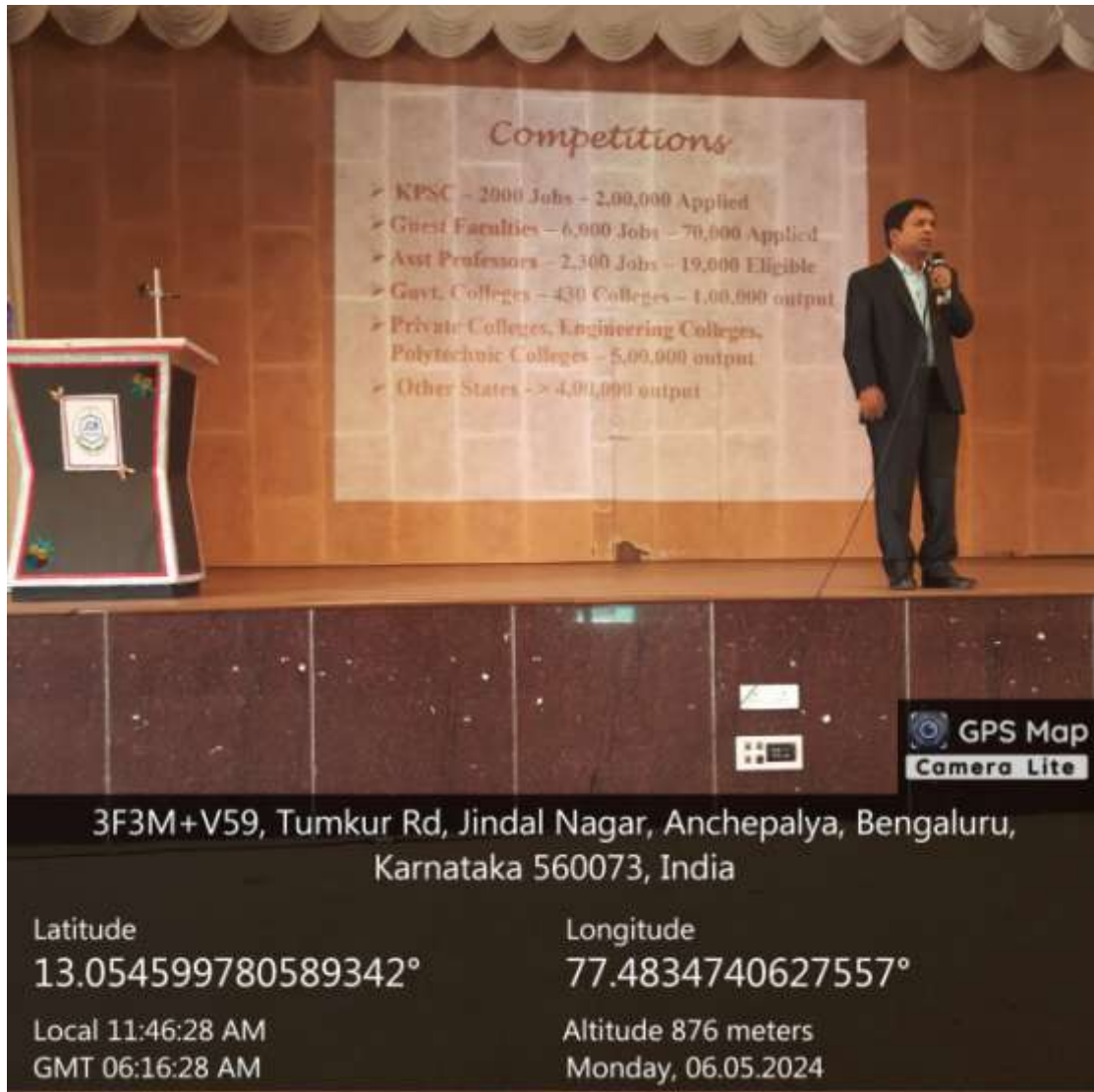
Orientation on Supply chain management